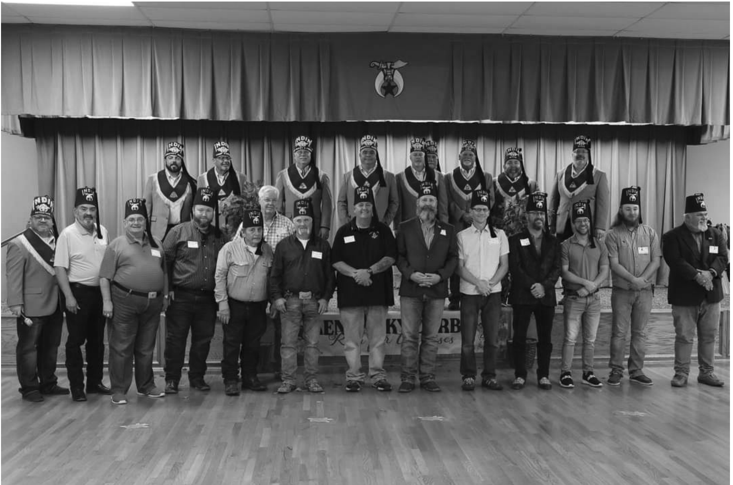
Spring Ceremonial Class of 2023